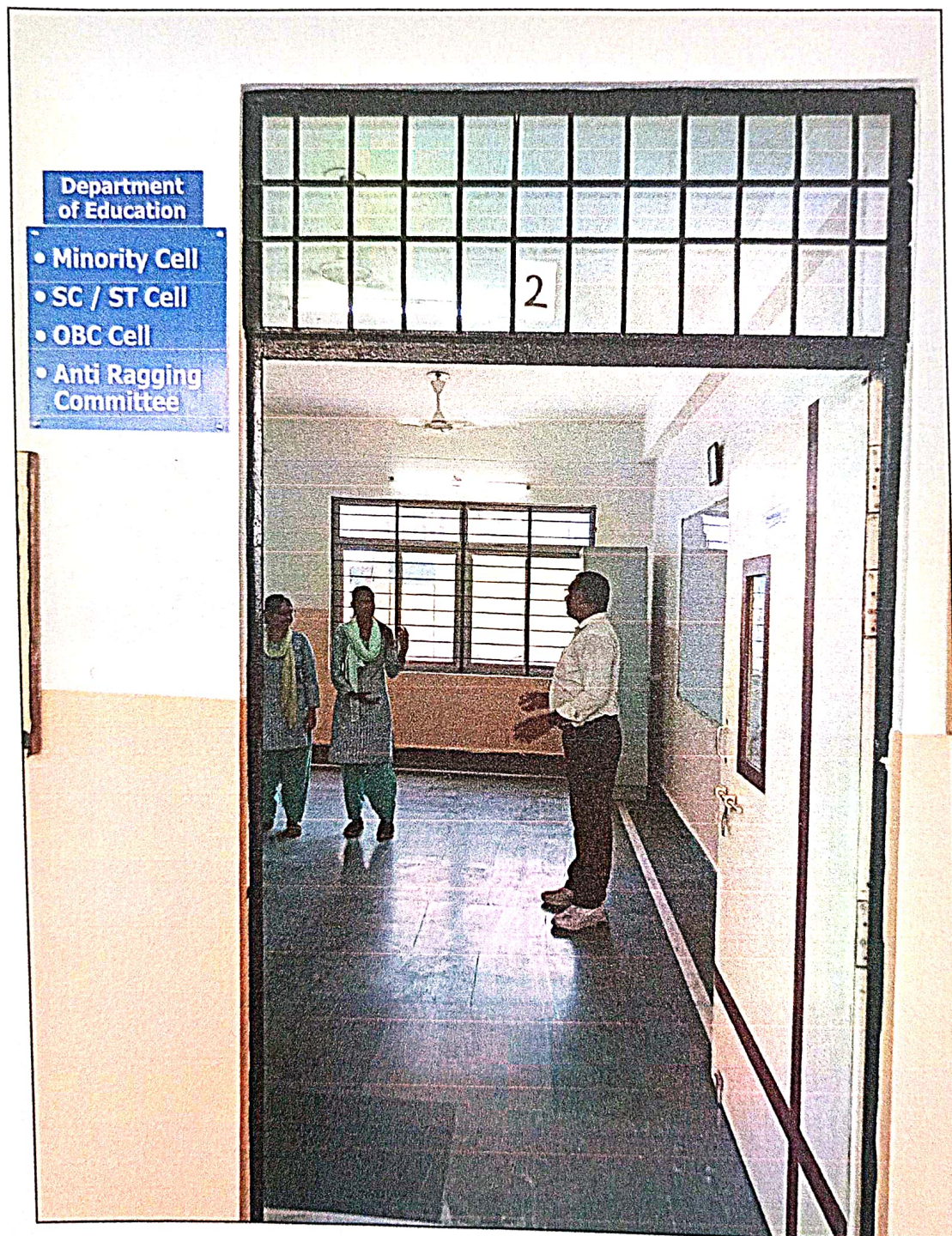
Minority Cell discussion with students about scholarship

2D/HS-1, Vrindavan Yojna, Raibareilly Road, Lucknow, Ph. : 2443963, 7080111596