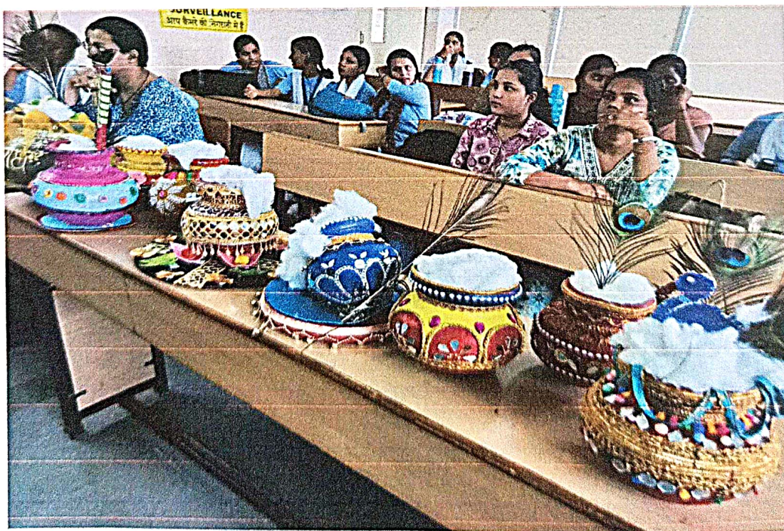
Cultural Program celebration